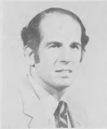
Dr. Larry Crook Medical Center